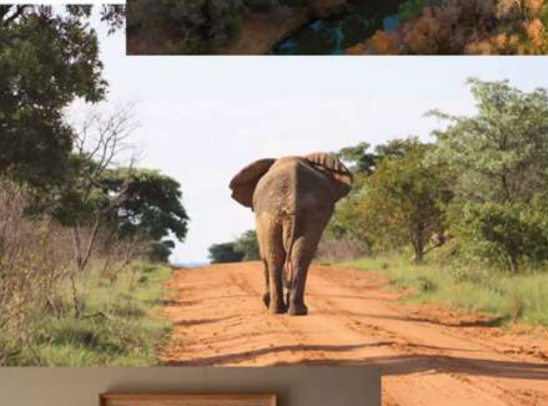
Left, below and top centre: Lepogo Lodges' Noka Camp, Lapalala