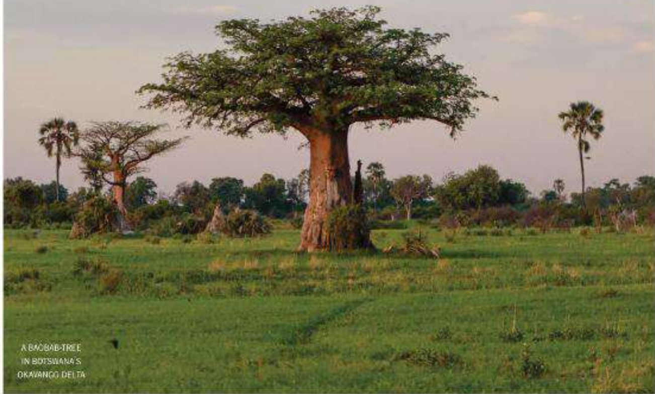
A BAOBAB TREE IN BOTSWANA'S OKAVANGO DELTA

Conquer rugged terrain, meet majestic lion prides and discover the wonders of wine country on an exhilarating journey across South Africa and Botswana